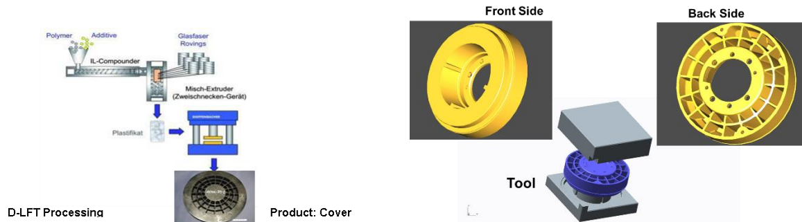
Fig 2. D-LFT moulding (left) and post processing of cover parts (right)