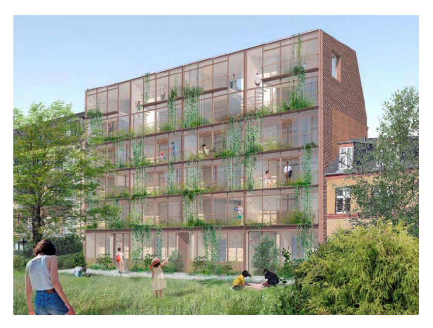
Glazed extension with 3 layer Velfac windows according to Active House standard