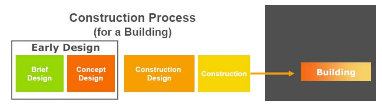
Figure 1: Construction process for a building (source: Pfitzner et al., 2007).

Subtask B deals with methods and tools for solar design that architects use at early design phase (EDP). Whilst the term "early design phase" is very commonly used in discussing the building design process, it invariably refers to the stage of work where initial design ideas are being conceptualized in tandem with the formulation of the building project equirements [Lam, Chun Huang & Zhai, 2004]. It is generally recognized that this is an adaptive-iterative process [Mahdavi & Lam, 1993 via Lam, Chun Huang & Zhai, 2004]. However, it is often not clear in practice when this phase ends and the next begins [Lam, Chun Huang & Zhai, 2004]. According to Pfitzner et al [2007], the "Early Design Phase" (EDP) starts with the first client contact and ends with a design with recognisable functions, visualised for easy understanding and with a cost calculation to support the client's "go/no-go" decisions. This is illustrated in figure 1.