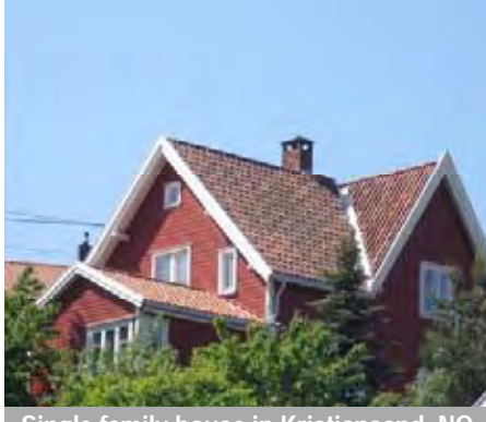
Single family house in Kristiansand, NC