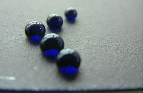
Colored TISS coating on PPS absorber (left) and colored water droplets on TISS paint surface (right).