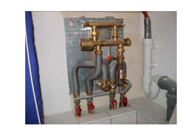
Heat exchanger LOGOTERM for domestic hot water