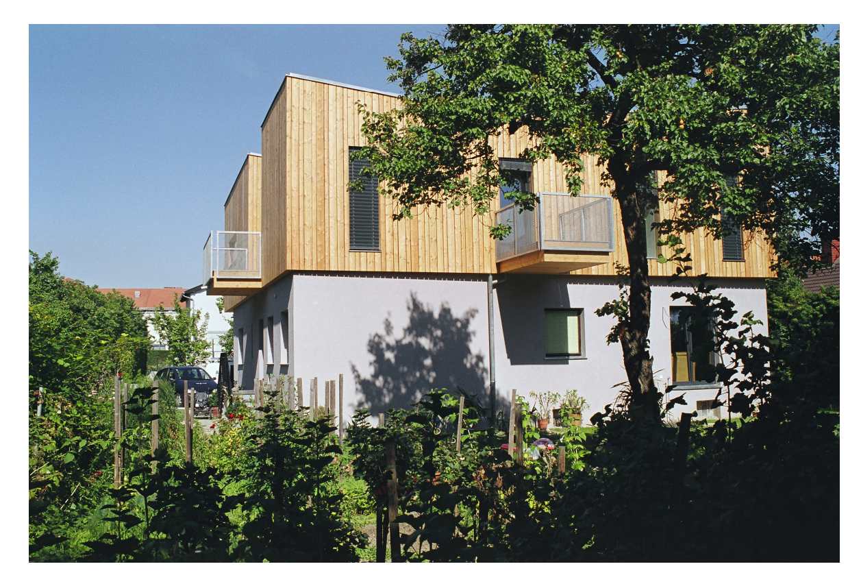
IEA – SHC Task 37 Advanced Housing Renovation with Solar & Conservation